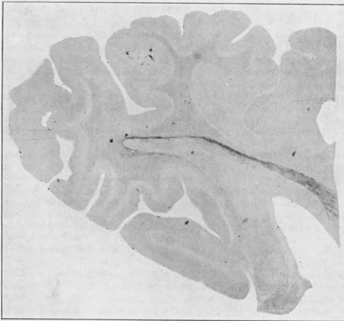
FIG. 1.—Horizontal section of the occipital lobe, stained by Weigert-Pal method and showing the general absence of myelinated fibres except in the optic radiations which stain fairly dark.

On examination in the National Hospital she was seen to be a fairly well nourished child of the normal size for her age. She lay in bed with the head retracted, the arms extended, the back bent forwards and the legs crossed. She whined continually. She was quite incoöperative and inattentive but she opened her eyes widely if her name was spoken in either ear. She seemed to be quite blind. The skull measured 49.5 cm. in its greatest circumference. The pupils reacted to light but constantly varied in size. The optic discs and